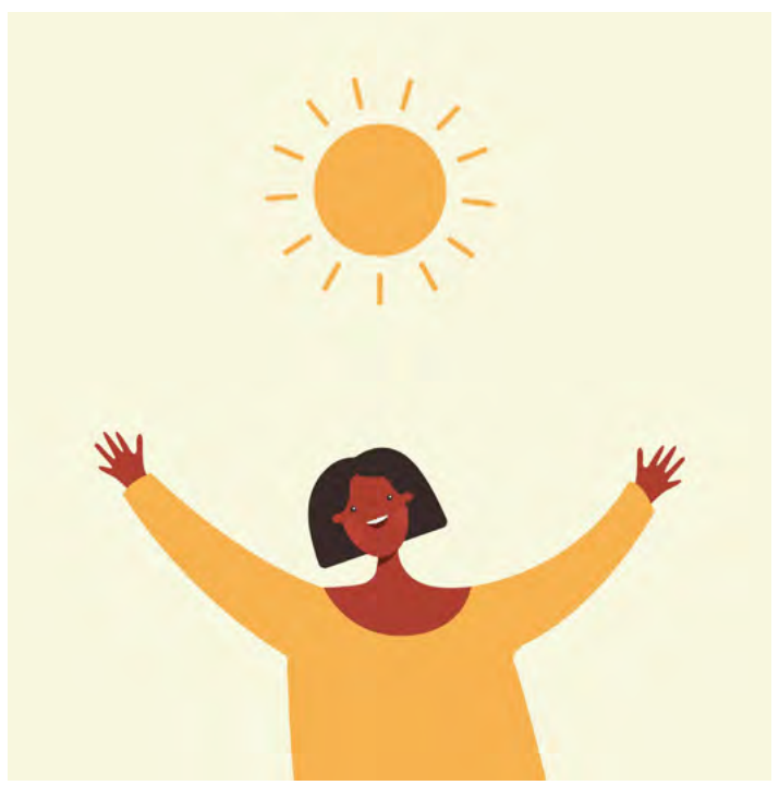
THINGS THAT HELP ME FEEL FRIENDLY